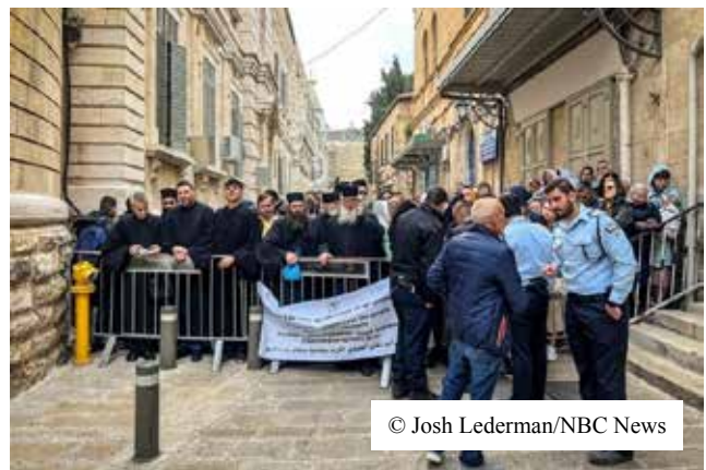
Israeli police keeping Christian worshippers away from the Church of the Holy Sepulchre in the Christian Quarter of the Old City of Jerusalem. 16