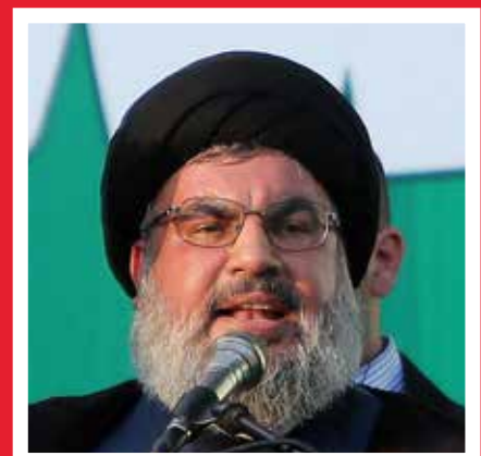
Hassan Nasrallah Hezbollah leader 1

You won’t succeed in returning the citizens of the north home. Do what whatever you want, you won’t succeed. The only solution is to stop the aggression against the people of Gaza. Neither military escalation, murder, nor an all-out war will bring your settlers and inhabitants back to the border.”