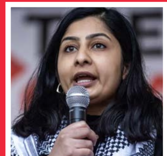
Zarah Sultana MP for Coventry South. 56

“It is sheer hypocrisy for the government to call for a ceasefire, condemn the humanitarian crisis and decry the lack of aid, while continuing to enable the Israeli military to commit war crimes. The UK must impose an immediate embargo on all arms sales – direct and indirect – to Israel and ensure it is no longer complicit in oppression, war crimes or crimes against humanity anywhere in the world.”